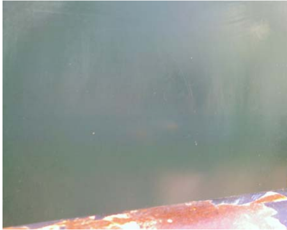
May 21, 2008 Graffiti removed at 17 th and Noe.